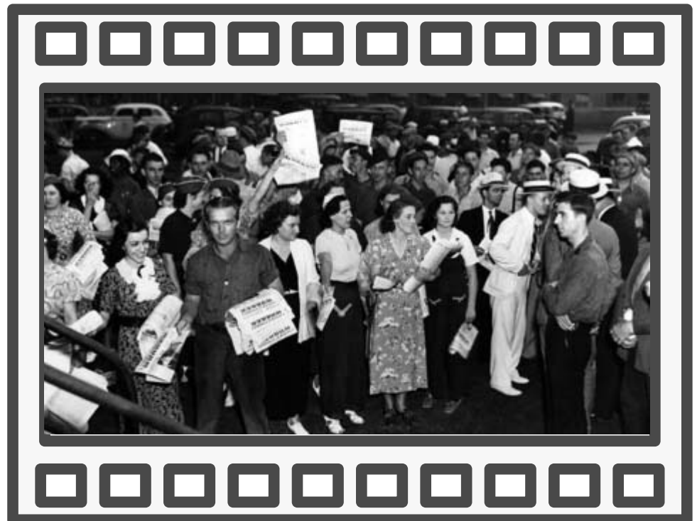
UAW Women's Auxiliary pass out the "United Automobile Worker" newsletter at the Ford Rouge Plant, 1940

Lunch will be provided by the Northeast Wisconsin Building and Construction Trades Council.